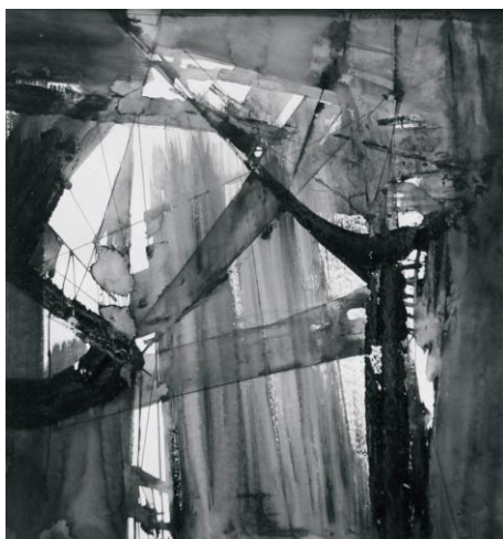
Figure 3: Untitled III , Acrylic on Paper, 55.8 cm X 55.5 cm, Shad Fatima