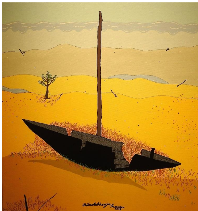
Figure 1: End of Journey, Acrylic on Canvas, 76.2 cm X71.1 cm, Artist-Bikas Mukherjee