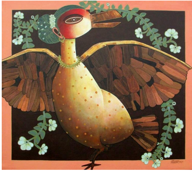
Figure 5: Dancing, Acrylic on Canvas, 76 cm X 81 cm, Artist-Dipankar Mukherjee