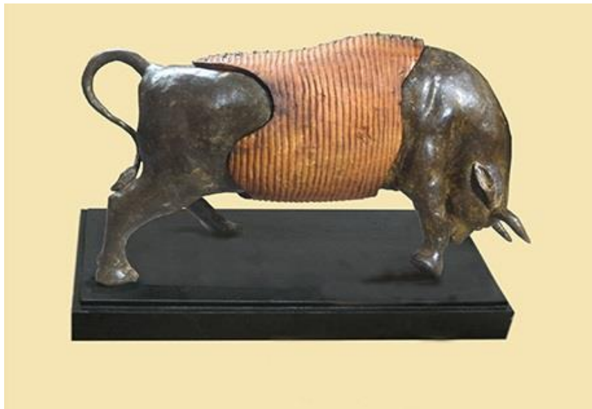
Figure 4: Power, Bronze and Wood Sculpture, 45.7 cm X 17.8 cm X 25.4 cm, Artist-Subrata Paul